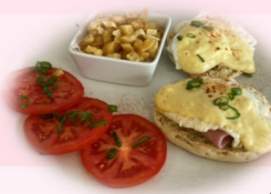
Canelitas Benedict Eggs